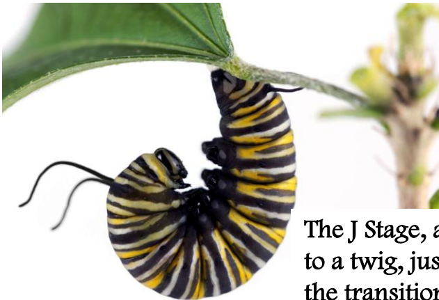
The J Stage, attached to a twig, just before the transition to chrysalis