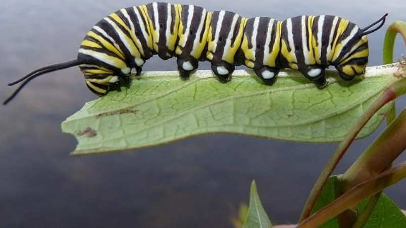
Feeding on host plant (milkweeds)

Photos licensed for use in Draw Paint Letter™