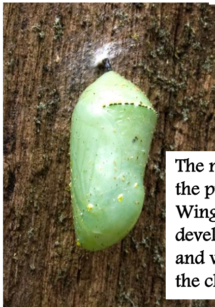
The monarch will remain in the pupa stage for 8-15 days. Wing pigmentation will develop in the final 48 hours and will be visible through the chrysalis.